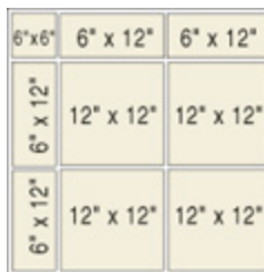
Floor With Border