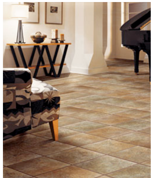
Natural Stone Look