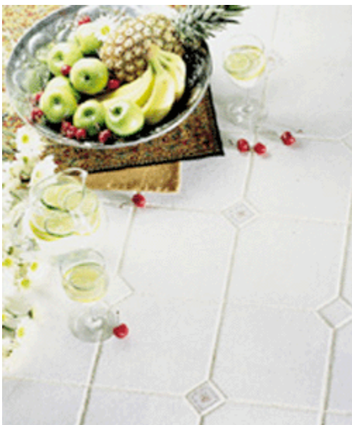
Solid Color Tile